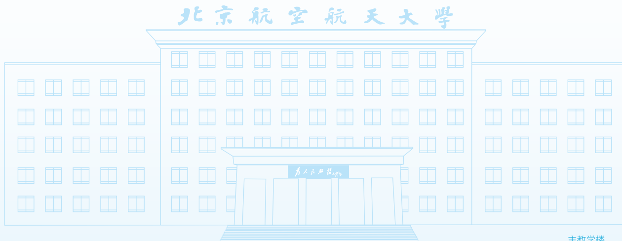
主教学楼 Main Teaching Building

International Chinese Language Teachers (Confucius Institute) Scholarship